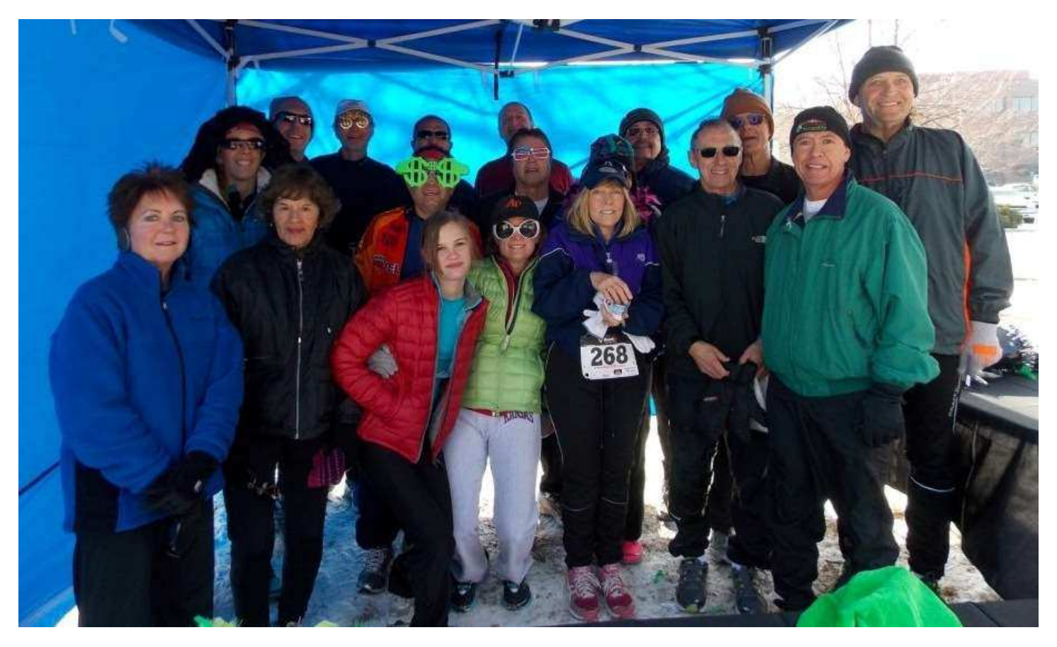
CMRA New Years 5K-Arvada, very cold at 10 am!