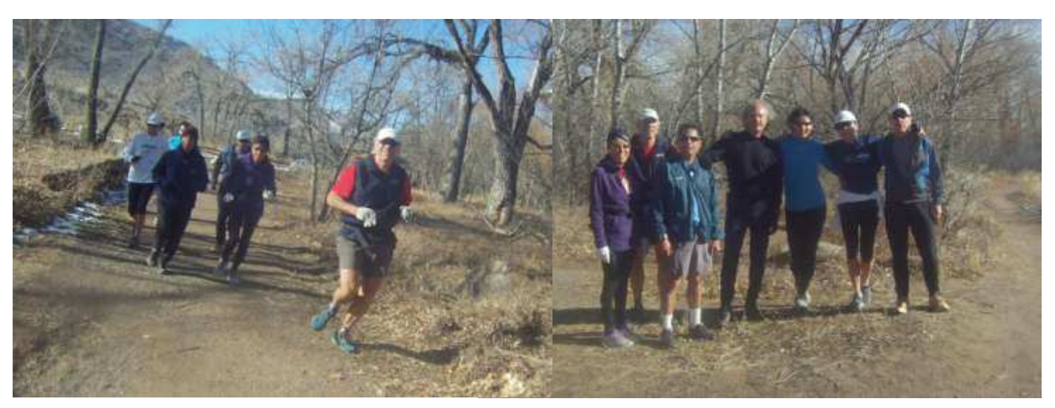
Training run Bear Creek Park 12/28/12